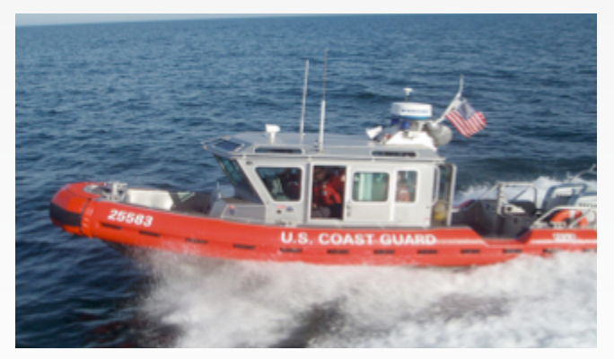
US COAST GUARD 25-FT RESPONSE BOAT SMALL (RB-S)