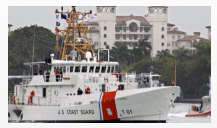
US COAST GUARD 154-FT FAST RESPONSE CUTTER (FRC)

We would welcome the opportunity to present our product and discuss the possibility of using Fortress Anchors aboard the vessels you are currently in the process of designing. I look forward to hearing from you in the near future.