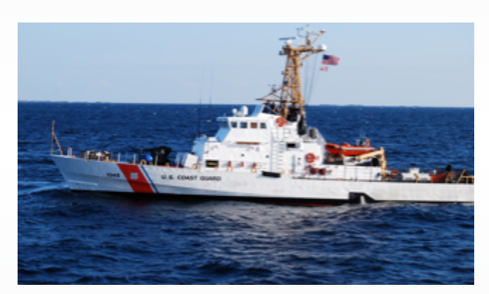
US COAST GUARD 110-FT ISLAND CLASS PATROL BOAT (WPB)