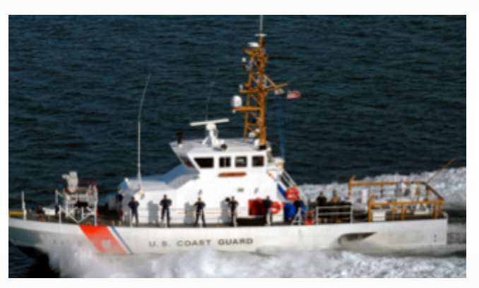
US COAST GUARD 87-FT COASTAL PATROL BOAT (WPB)