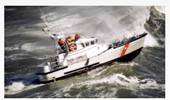
US COAST GUARD 47-FT MOTOR LIFEBOAT (MLB)